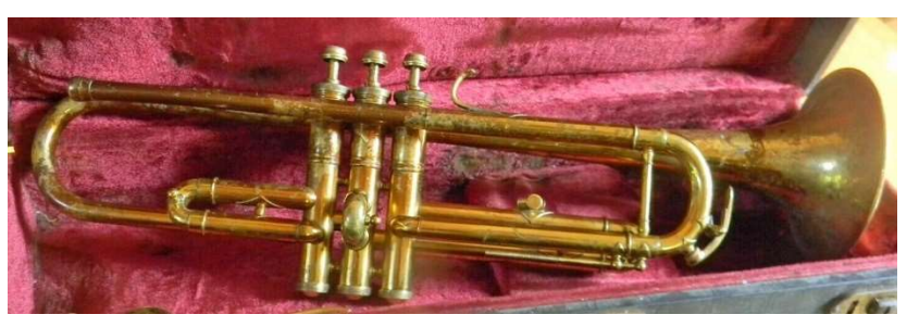
1927 ad in Musical Merchandise

Vitak-Elsnic Co trumpet below (probable imported stencil) with 1930s-style case (auction photo).